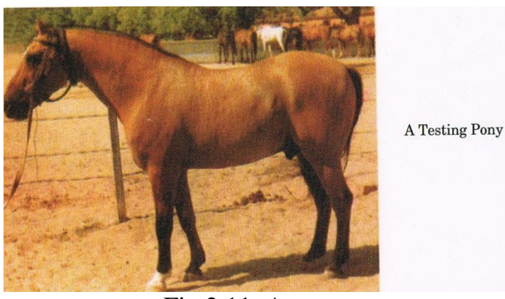
Fig.2.11: A pony