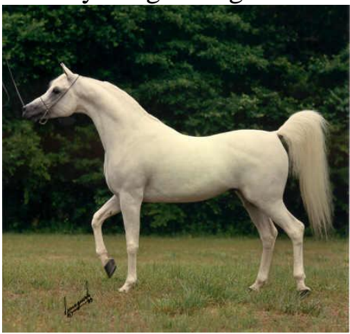
Fig.2.8: Dished appearance face

The Arabian horse is characterized by four colors, namely, grey, bay, chestnut and brown. However, black and white colors are rarely seen in Arabian horses, while the grey is the dominant color and the brown is the recessive one (Fig.2.10). The height of Arabian horse ranges between 14-15 hands and its body weight ranges between 400-500 kg.