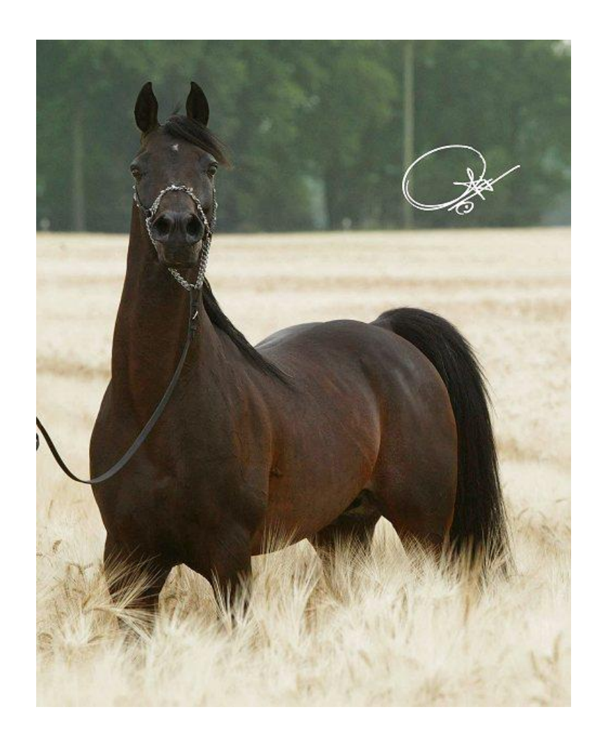
Fig.2.10: Brown colored horse with wide nostrils