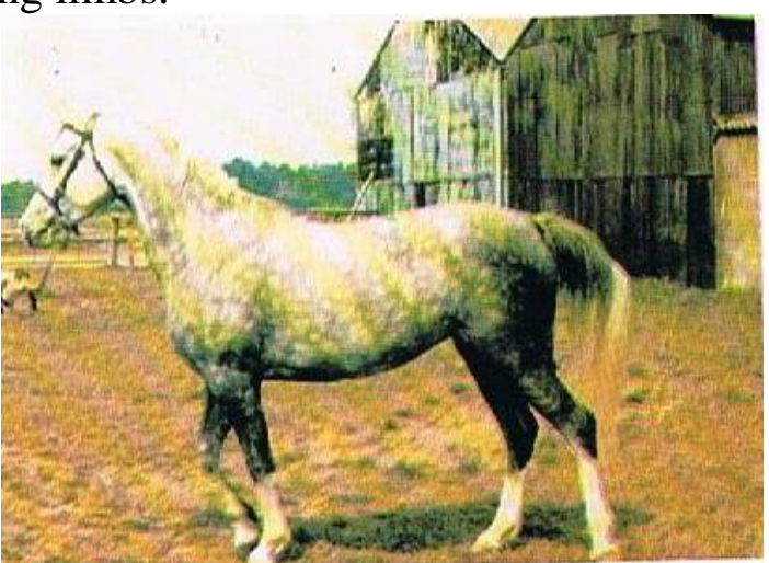
Fig. 2.6: Saddle bred horse

This horse is characterized by its body size with a height ranges between 15-16 hands and 500-600 kg body weight (Fig.2.6). It possesses small head, long neck, erected tail at the base, long back and long limbs.