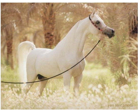
Fig.2.9: erected tail