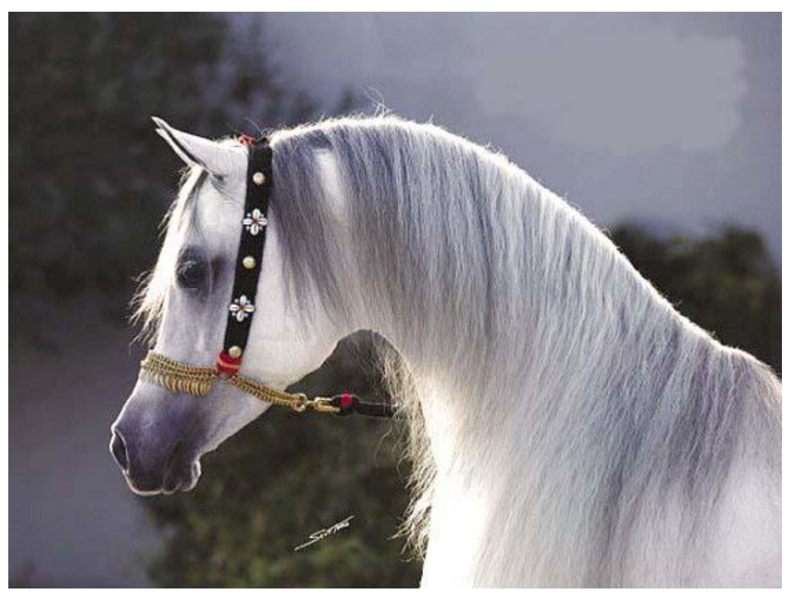
Fig. 2.7: Arabian Horse, arched neck.

The Arabian horse is characterized by four colors, namely, grey, bay, chestnut and brown. However, black and white colors are rarely seen in Arabian horses, while the grey is the dominant color and the brown is the recessive one (Fig.2.10). The height of Arabian horse ranges between 14-15 hands and its body weight ranges between 400-500 kg.