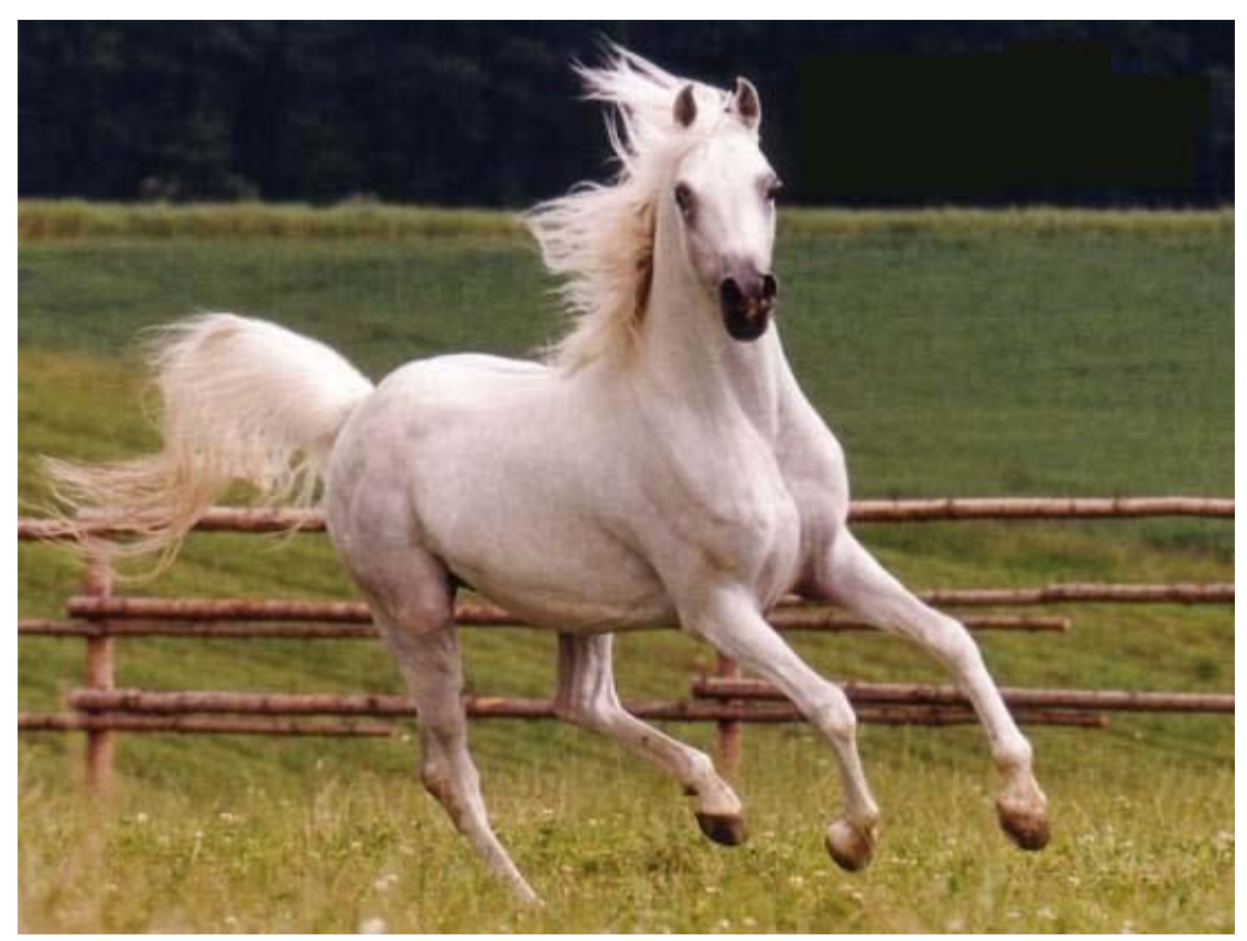
Fig. 2.7: Arabian horse

The Arabian horse is characterized by its distinctive head (Fig.2.7). The bulging forehead and concave face gives a dished-appearance (Fig.2.9)