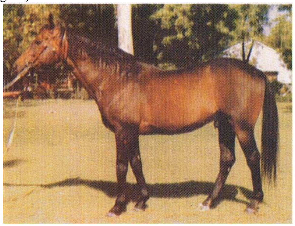
Fig. 2.3: Thoroughbred horse

thoroughbreds are the "Lord of Race track", they are the fastest. The height of this horse ranges between 15-17 hands and weighing 600 kg (Fig.2.3), while the colors of thoroughbred are black, brown, chestnut, dark brown and grey (Fig.2.4).