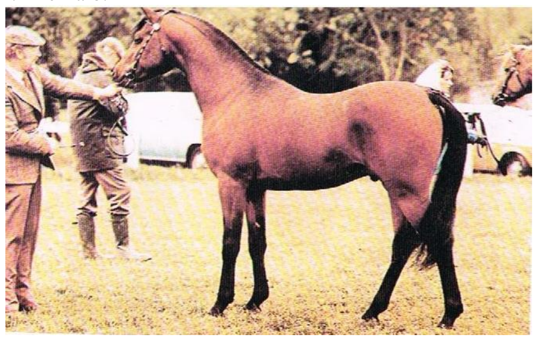
Fig.2.2: Light horse

The origin of this horse was North Africa, which existed with the Arabian horse during the eighth Century. It is an impure breed as the blood has been mixed with the Arabian one, thus no pure strain breed is found. The height ranges between 14-15 hands and weighing 400-500 kg. The Barb has contributed to the development of other important breeds. Off-springs of the famous Godolphin Barb (1689) were used as the original stock for development of the English thoroughbred. The barb stallion, Guzman, founded the Spanish breed "Guzmanes" . the horse which was brought to America by the Spanish explorer were strong in barb blood.