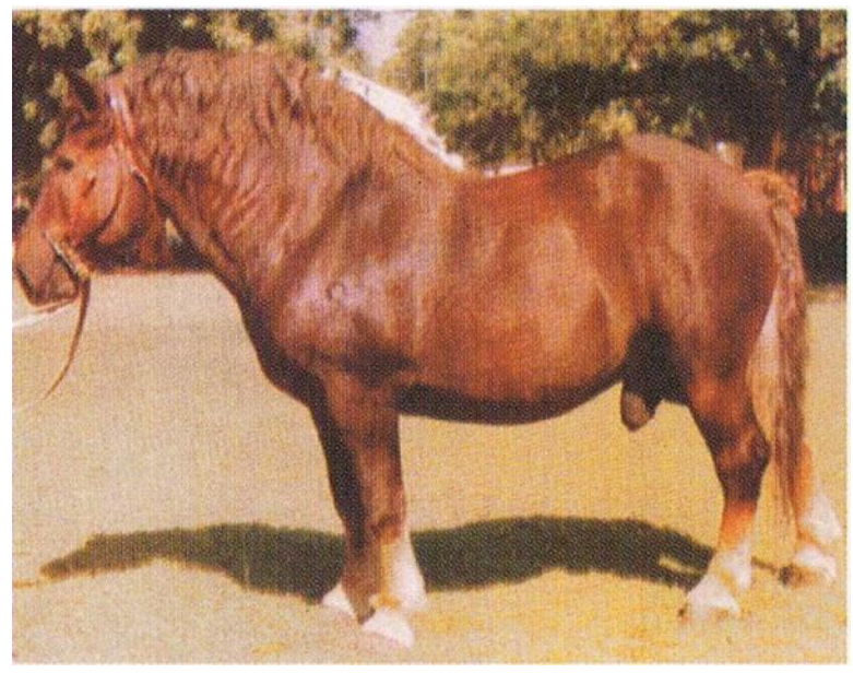
Fig.2.1: Draught horse