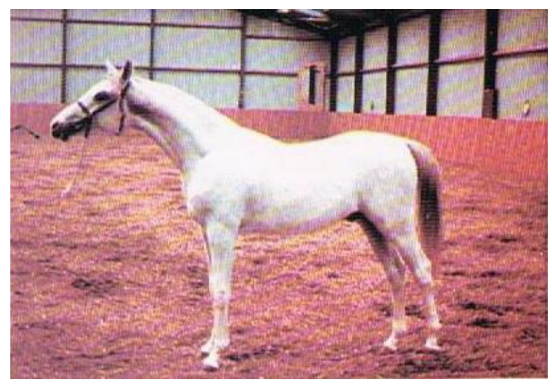
Fig.2.4: A Grey horse