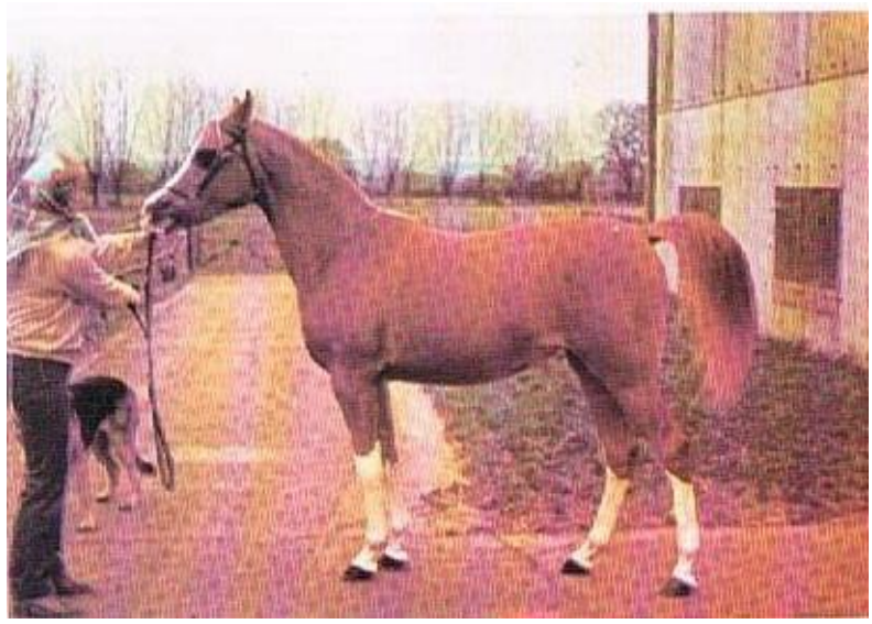
Fig 2.5 : A Chestnut horse

The horse was produced during the 13th century in USA and it is now considered as the famous horse there. It is called the quarter horse due to its rapid speed during the first quarter of mile at the racing yard. The horse is mainly used by cattle owners for controlling their animals during grazing as well as in polo games. The height of the horse reaches 15 hands and of different colors.